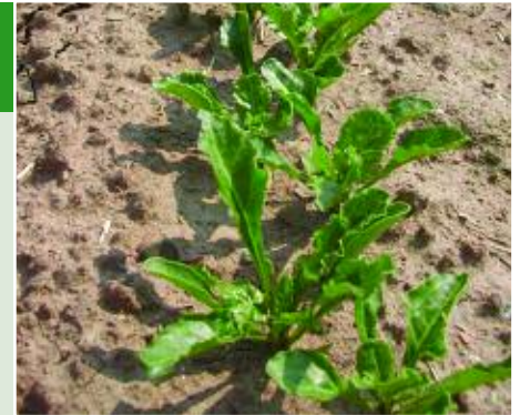
Beet crops on light land could benefit from sulphur applications.

"Another option would be to apply a product such as Double Top, which is often used on oilseed rape. Double Top at 125kg/ha will supply 38kg/ha