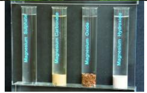
Kieserite (magnesium sulphate) is water-soluble, making it suitable for potatoes.

Noting the need for new research, the Potato Council review points out particularly high Mg soil indices may induce potassium shortages. This is estimated to occur over about 13% of the UK's potato-growing area, notably in the north, the review adds. ■